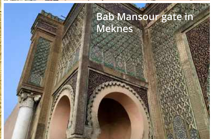
Bab Mansour gate in Meknes