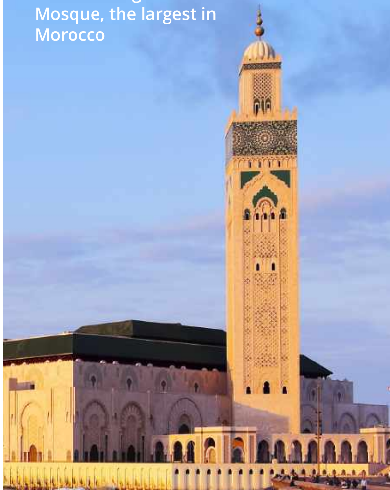
The stunning Hassan II Mosque, the largest in Morocco