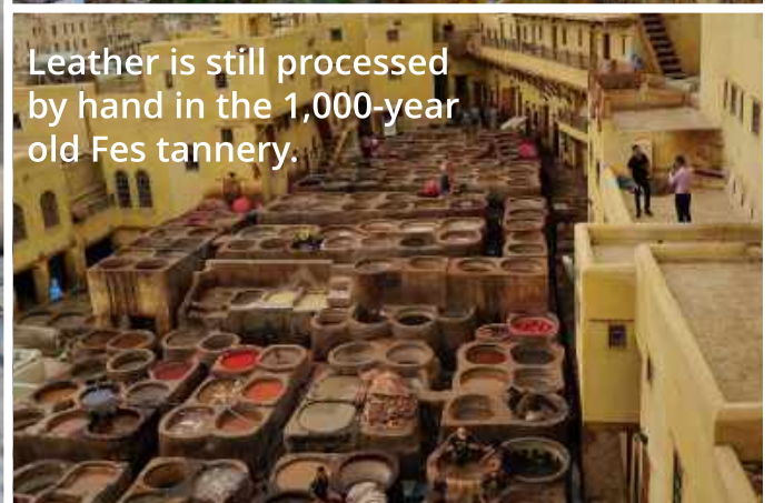
Leather is still processed by hand in the 1,000-year old Fes tannery.