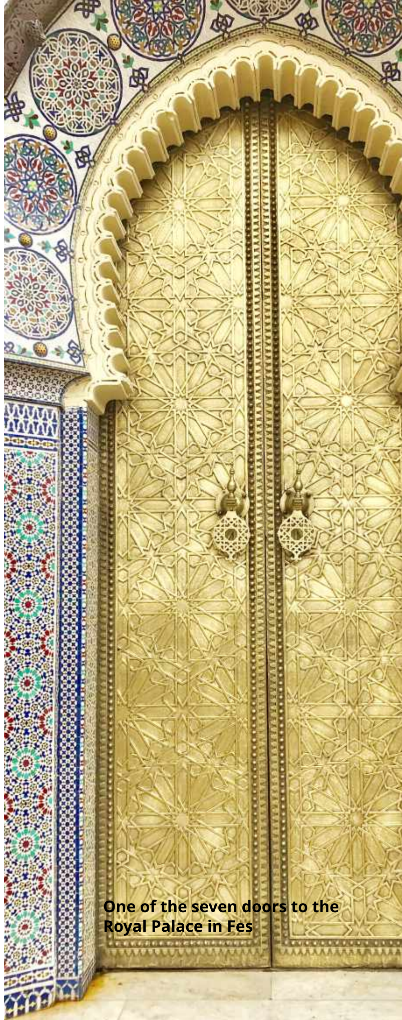
One of the seven doors to the Royal Palace in Fes