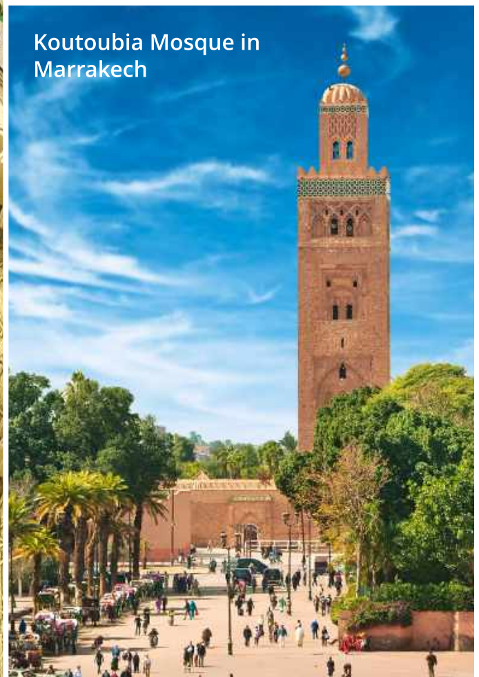
Koutoubia Mosque in Marrakech