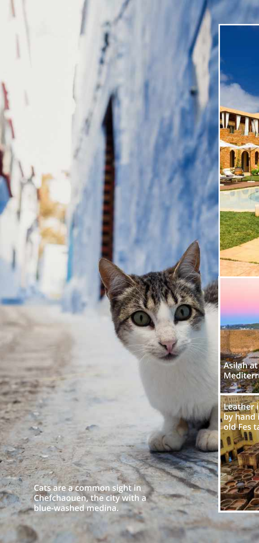
Cats are a common sight in Chefchaouen, the city with a blue-washed medina.