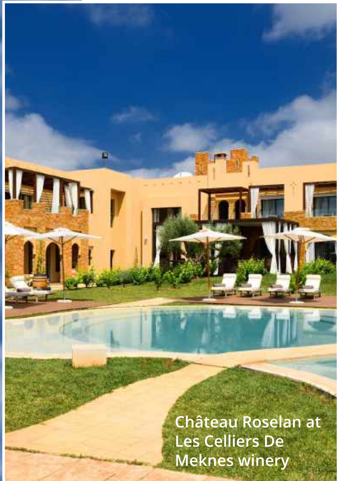
Château Roselan at Les Celliers De Meknes winery