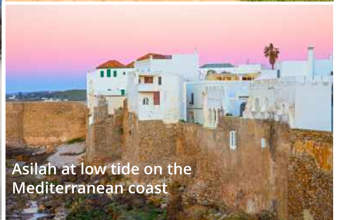
Asilah at low tide on the Mediterranean coast